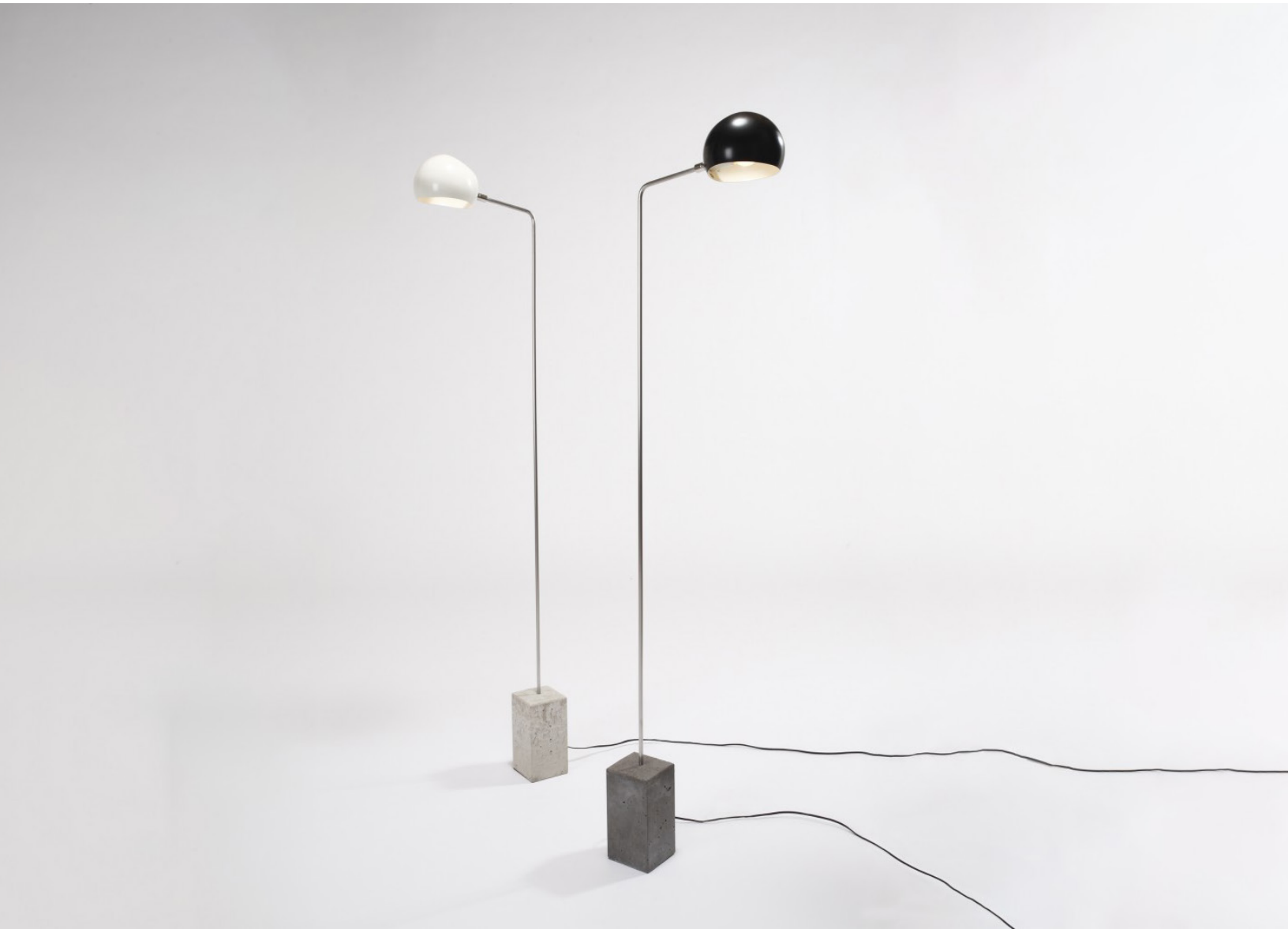
Classic. Modern. The Cement Standing lamp from David Weeks Studio.