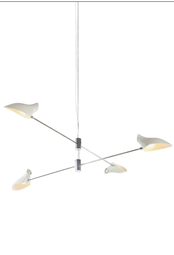
Shown above with two tiers