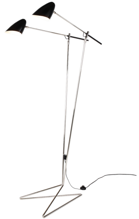
Shown above with Bullet shades