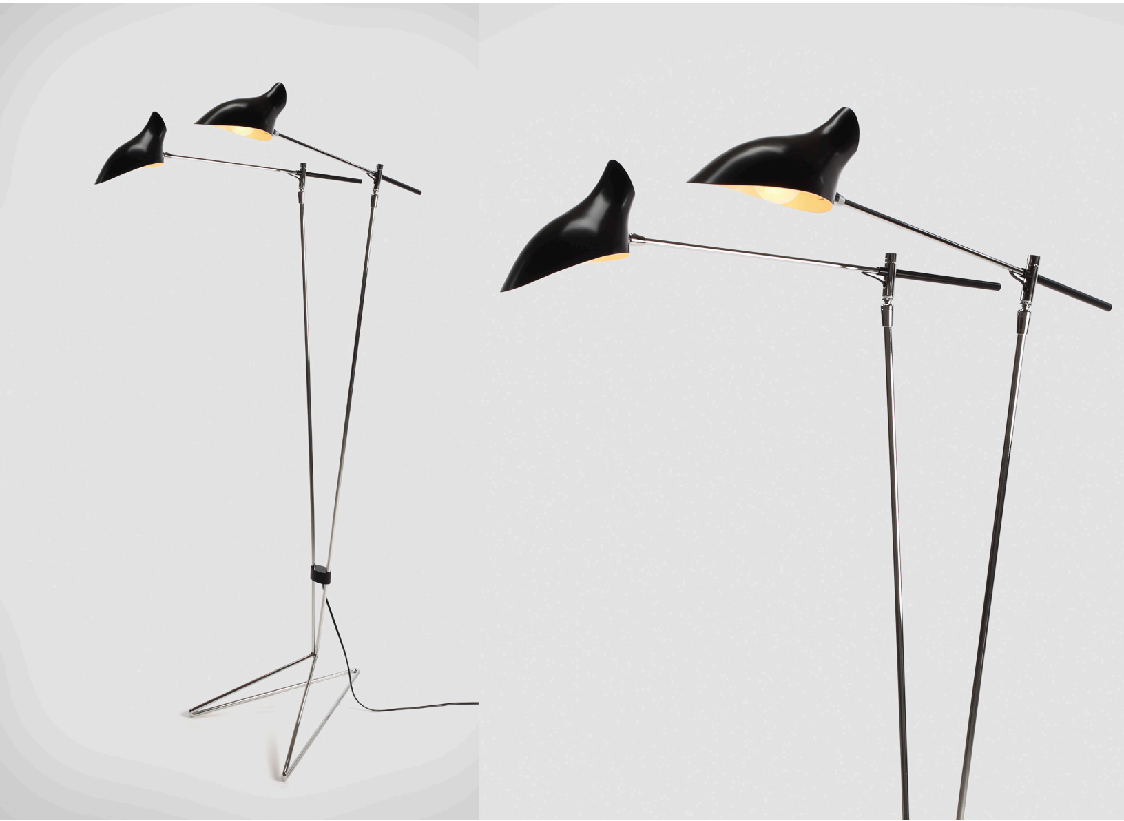
Classic. Modern. The Double Pod Standing lamp from David Weeks Studio.