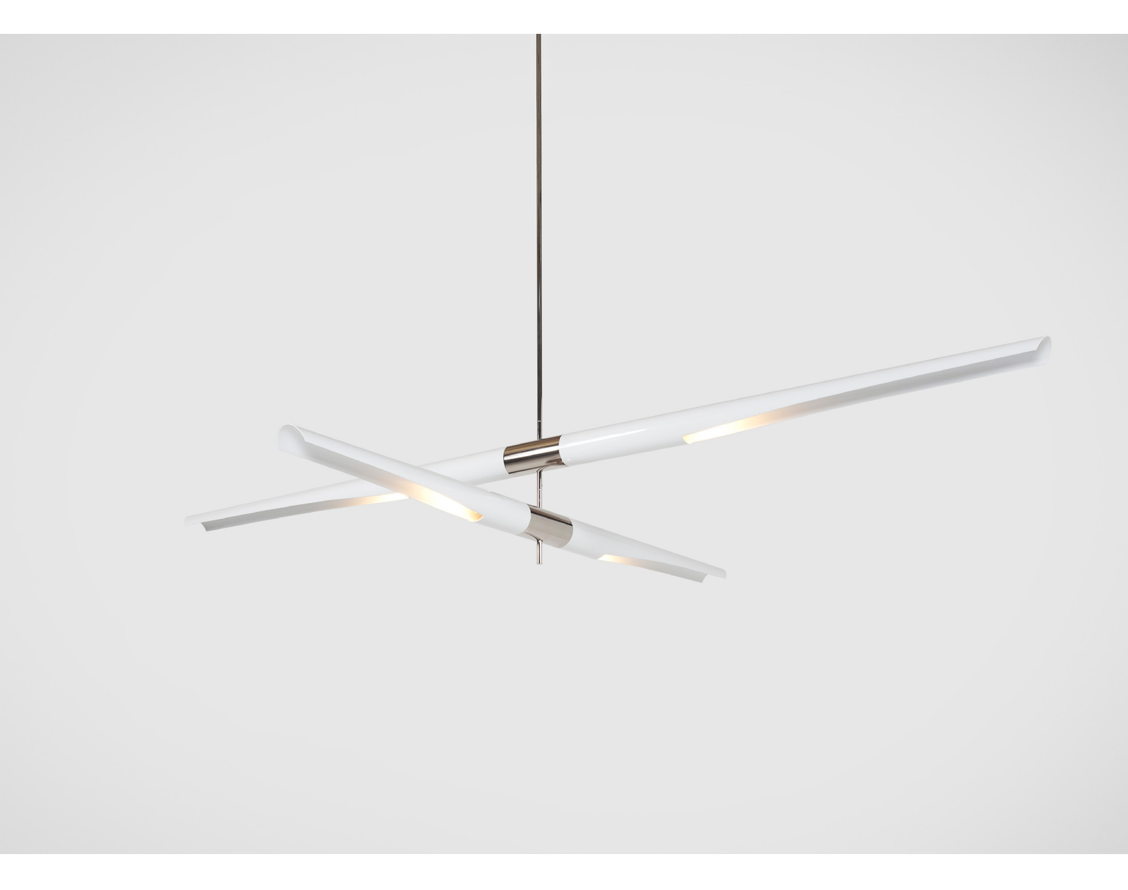
Classic. Modern. The Hennen Cross ceiling fixture from David Weeks Studio.