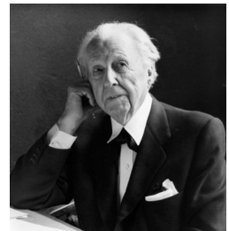
FRANK LLOYD WRIGHT